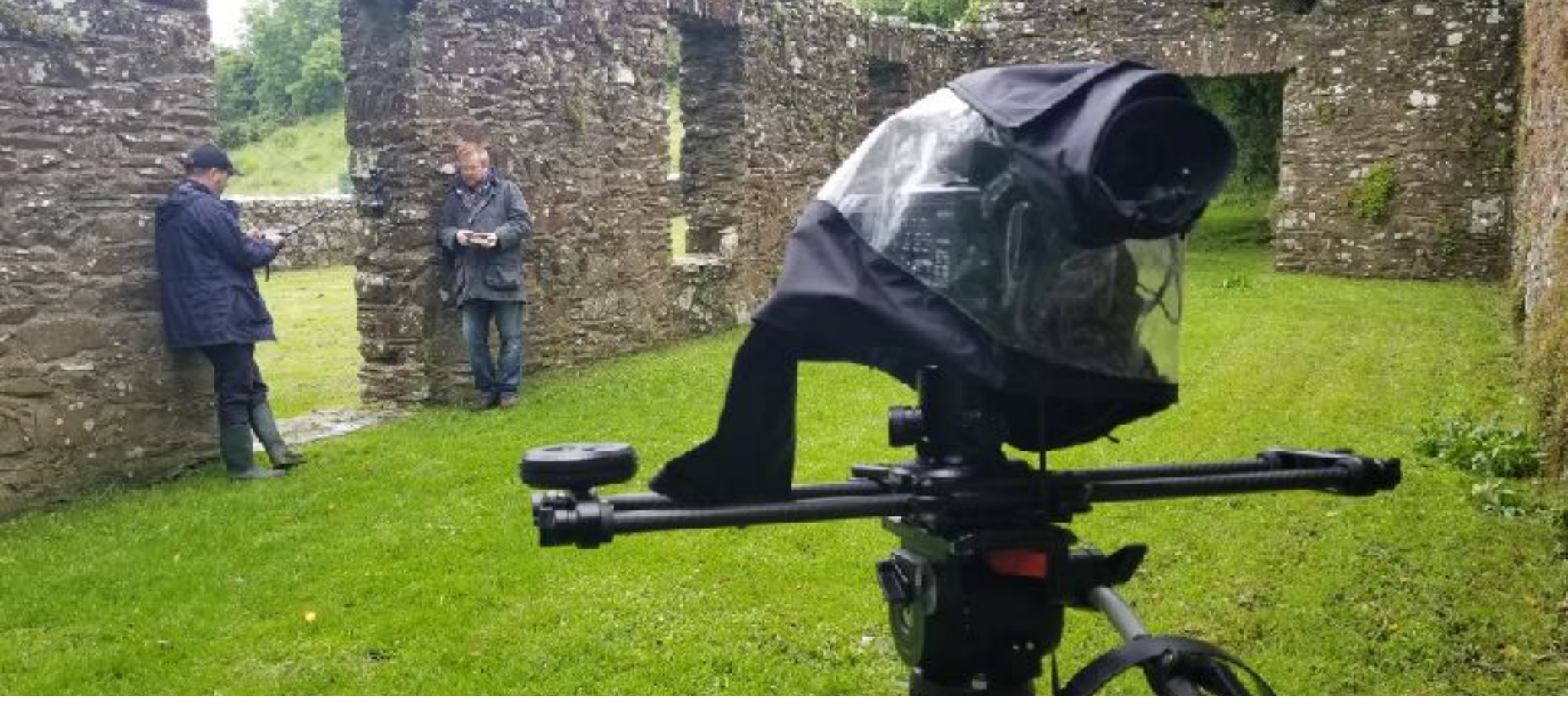
Filming on location in Ireland.

Praise the Lord! More and more wonderful stories like this are coming in. The power of the work of the Holy Spirt has been evident in the many lives of people near and far who have shared their stories with us.